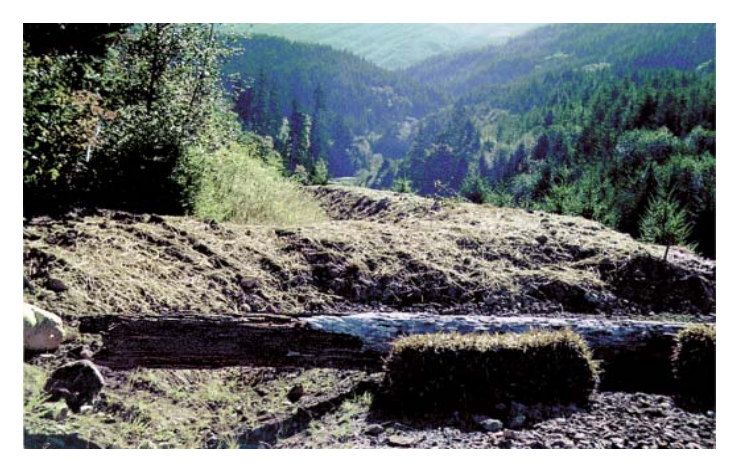
This road has been ripped and seeded, and access blocked with logs.