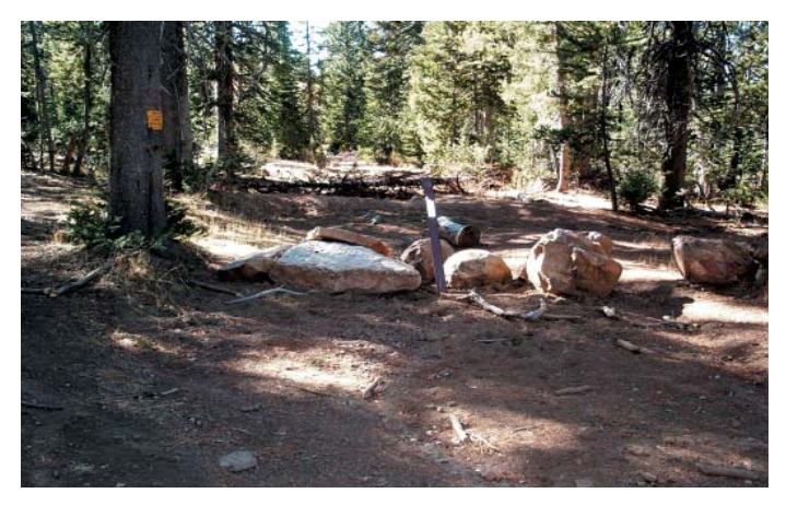
Rocks and logs have been placed to block access to this closed road.