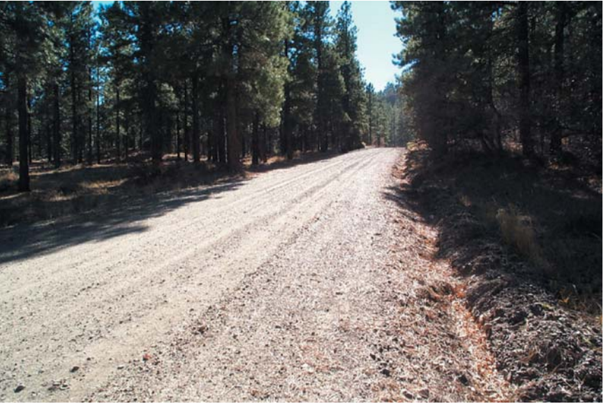
This forest road is located well away from water. Its gravel surface promotes drainage and lessens erosion. The road is crowned, so water drains away to both sides.

Water quality in forested areas can be impacted by many of these activities, including logging, fires, other construction, recreation, and grazing. However, poorly located, constructed or maintained forest roads are the largest source of non-point source pollution on forested lands. The greatest potential for degrading water quality comes from roads on steep slopes or erodible soils, and stream crossings. Research has shown that 90 percent of the sediment that ends up in our nation's waters from forested lands is associated with improperly designed and maintained roads. Sediment in streams leads to a number of problems for fish populations including