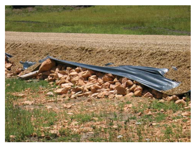
Geotextile is being used to strengthen this road through a wet area. Rock is laid on the wet surface, followed by geotextile and gravel on top.