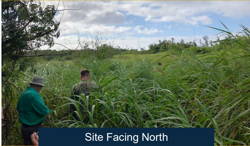
Site Facing North