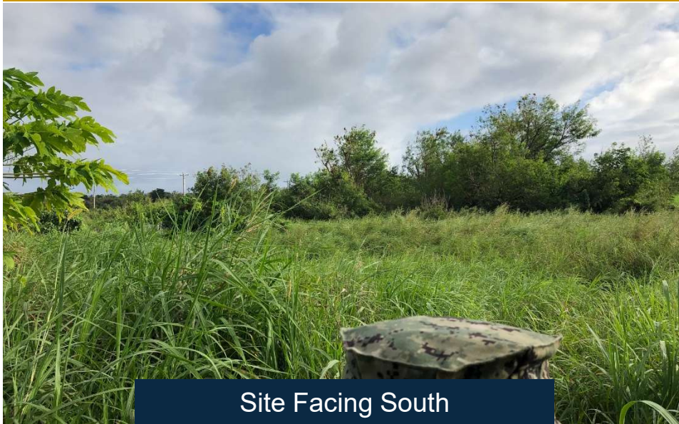
Site Facing South