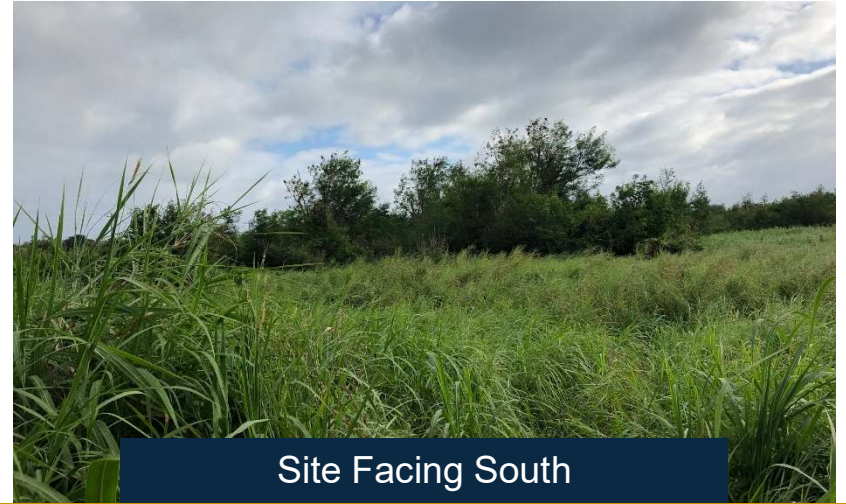
Site Facing South