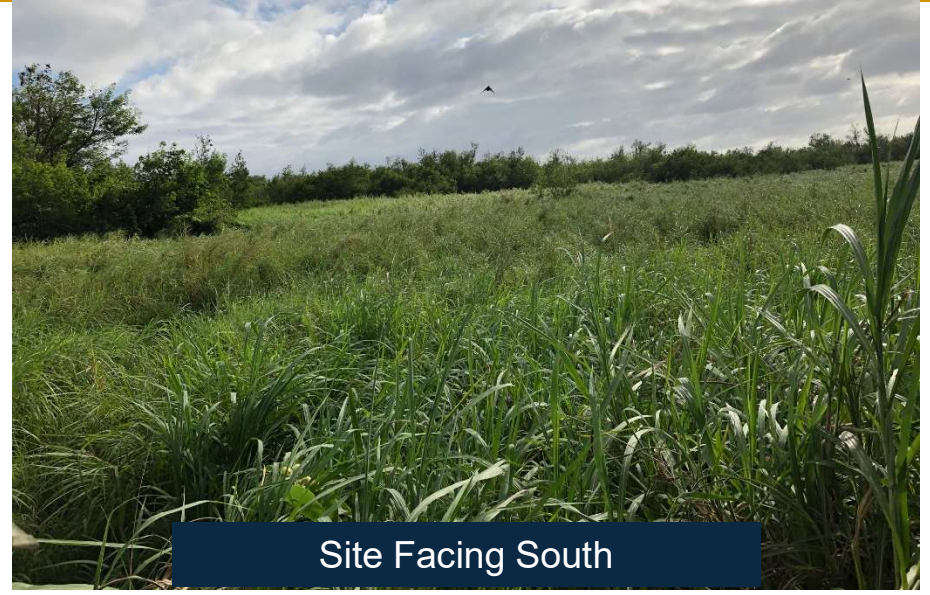
Site Facing South